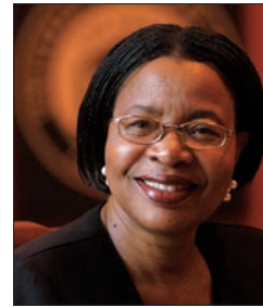
Chancellor Mrs Graça Machel